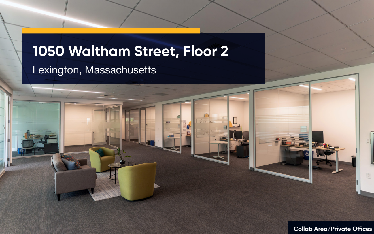
Collab Area/Private Offices