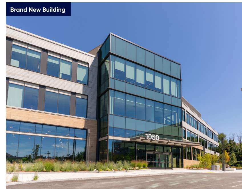
Brand New Building