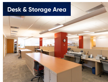
Desk & Storage Area