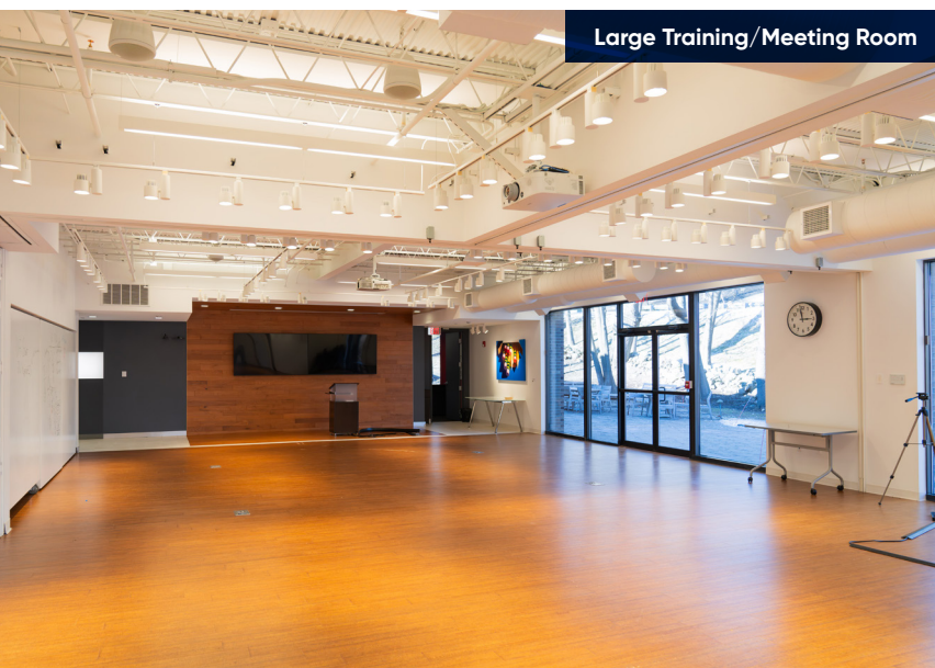
Large Training/Meeting Room