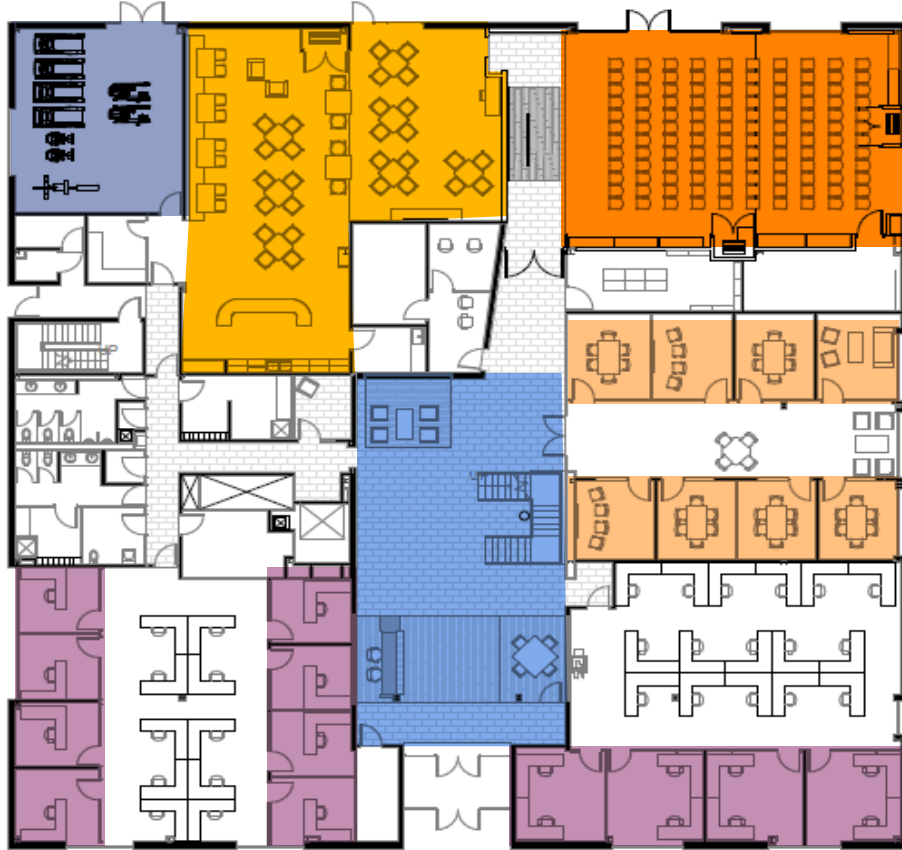
Floor 1: 15,000 SF