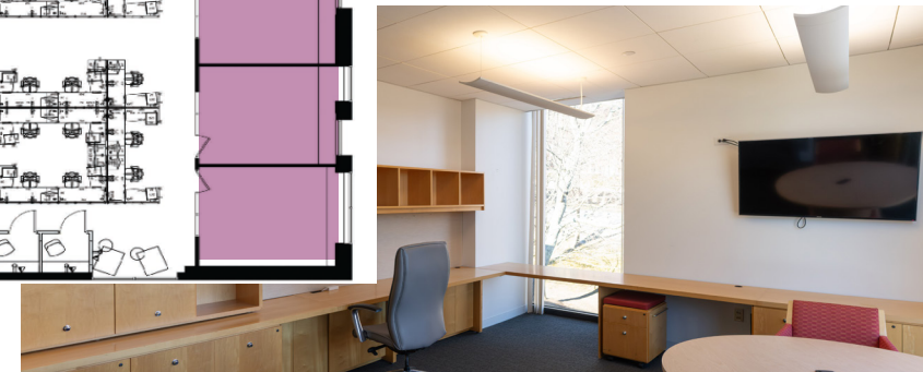
Large Private Office