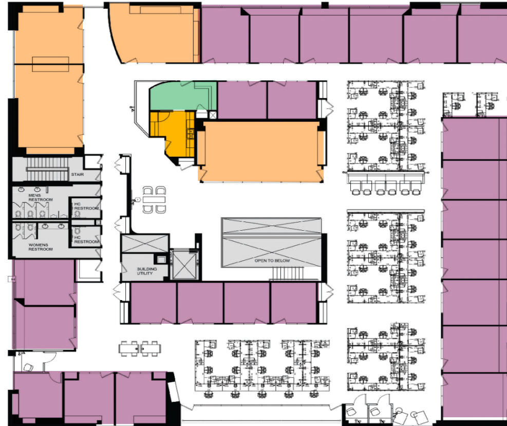
Floor 2: 15,000 SF